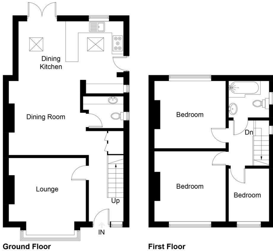
Illustration for identification purposes only, measurements are approximate, not to scale. Fourlabs.co © (ID1295734)

Approximate Gross Internal Area = 106.0 sq m / 1141 sq ft